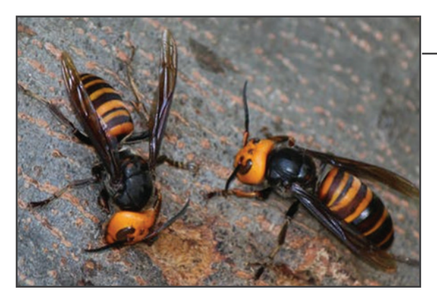
Northern giant hornet